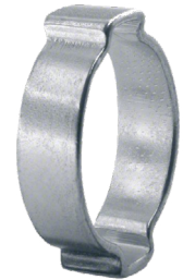
Oetiker Crimp Clamp