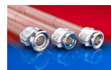
CONNECT SAFETY CLAMP ASSEMBLY 231