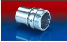
CONNECT THREAD FITTING 234