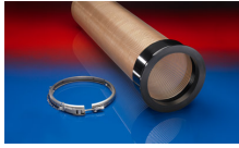
CONNECT 245 VAC-TRUCK

Distributed By: plastixs A GLOBEUS Company