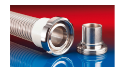
CONNECT MOULD ASSEMBLY 233

Positive and negative pressure ratings are the recommended maximum operating values. Products can be manufactured to meet higher operating values upon request. The bend radius is calculated from the center of the hose in an arched position. NORRES reserves the right to modify technical data at any time. Technical data based on tests at 68°F and are approx. values. Proper use and maintenance of NORRES hoses is the sole responsibility of purchaser and ultimate user of the product. The individual conditions, applications and the number of variables make firm recommendations technically impossible. This information is intended as a general guide only.