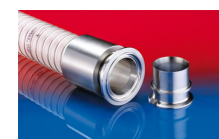
CONNECT PRESS ASSEMBLY 232